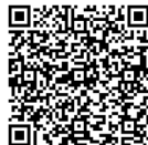
To get quotation by SMS