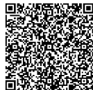
To get quotation by email

P.O. Box. 227, Postal Code:320 Nakhla Road, Barka(Sultanate of Oman) T: +968 26883982 F: +968 26883982 M: +968 94584686 E-mail: oman@prakashpump.com