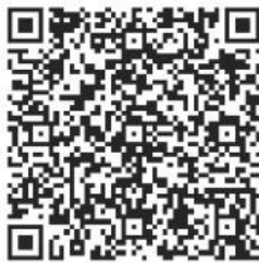
Scan QR Code to Get Quotation by Email