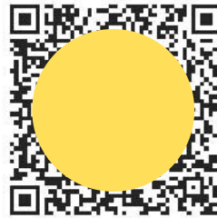
Scan QR Code to Download e-Catalogue